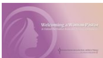
Welcoming a Woman Pastor