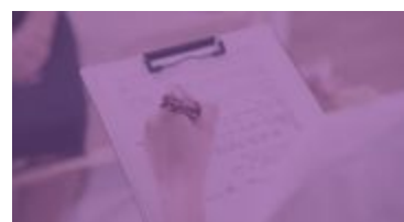
Starter Questions for Episcopal Discernment