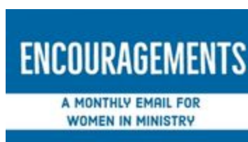
An Encouragement from the NC AC COSROW